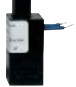
3-WAY LEAD WIRES